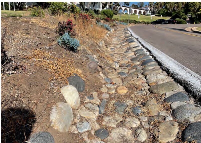
Presidio Park historic cobblestone curb and swale.