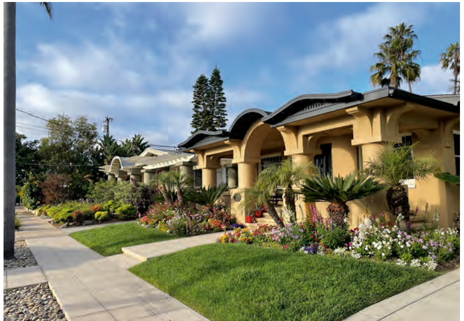
Bungalows in the Arnold & Choates Addition--North Florence Heights national register historic district.